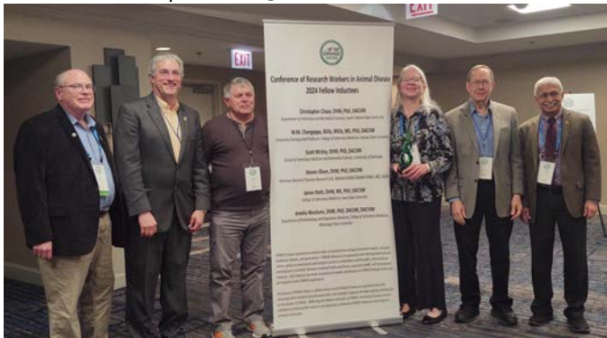
The 2024 CRWAD Fellow Inductees.

We thank our partners, speakers, sponsors, and members for making this year's conference a success. We look forward to next year's events, and welcome input from AAVI members as planning moves forward.