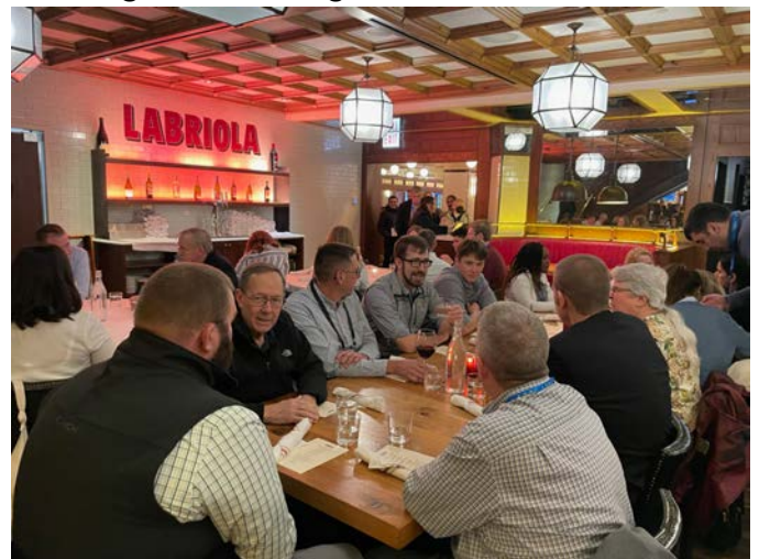
Annual Business luncheon at the Labriola.

January marked the second CRWAD meeting held since the dates moved from the former December timeframe. Our colleagues were able to successfully navigate challenges such as winter storms and delayed approvals to come together in Chicago for another great meeting with 546 registered attendees.