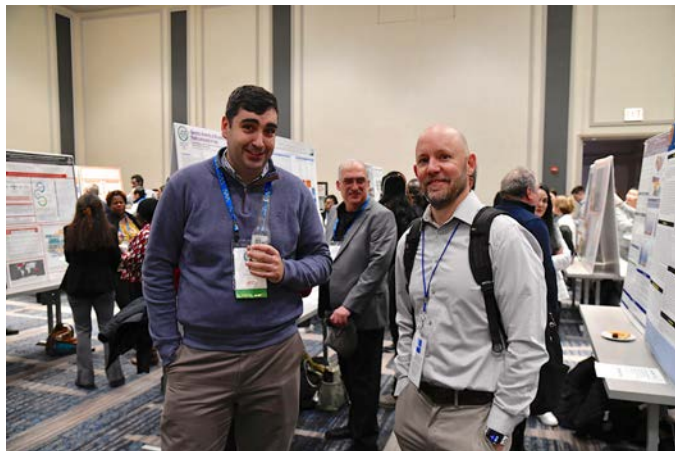
Colleagues enjoying the 2024 CRWAD poster session.